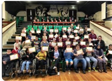
The awards ceremony... Filming of 'The Cosmic Wheelchair' in January