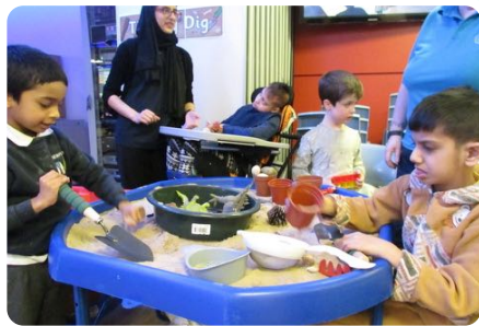
Exploring animals and their environments together