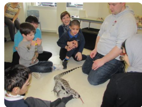
... a tortoise and a giant lizard!