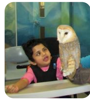
Meeting exotic animals from Curious Critters - a barn owl...