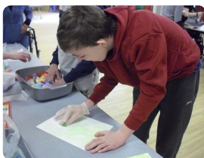
Science in the world of work - beauty salons and catering both involve lots of science and changes of states - older students used oils & nail varnish with Blackburn College beauty students, left, and above looked at melting wax crayons to experiment with different colours & effects for artwork.