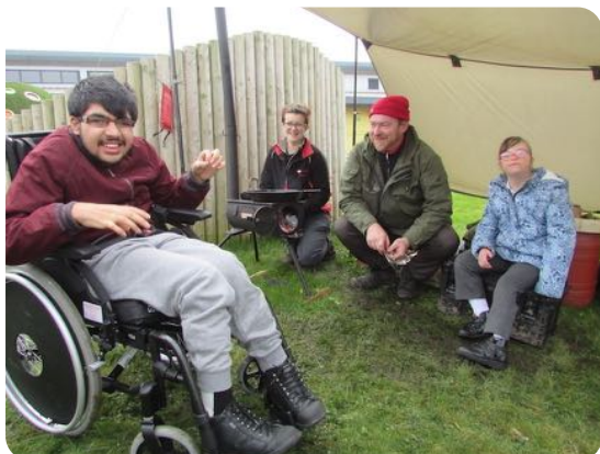
Learning about the Earth with a bush craft session where pupils have used natural things to make bread and cook it on an outdoor fire.