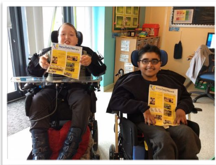
Learning at the Library .

Literacy skills in a weekly news update from S2.